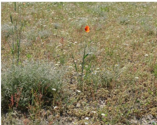
Abb. 16: Ackerbrache (Biotop Nr. 11, Blickrichtung Süden)

Weiterhin befinden sich vier Ackerbrachen im UG (Biotop Nr. 05, 11, 30, 37). Die Segetalflur wird zu großen Teilen von Kornblume ( Cyanus segetum ), Acker-Spergel ( Spergula arvensis ), Kleinem Sauerampfer ( Rumex acetosella ) und Einjährigem Knäuel ( Scleranthus annuus ) gebildet.