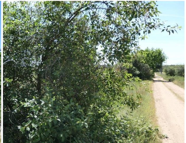
Abb. 8: Obstbaumreihe, lückig (Biotop Nr. 17, Blickrichtung Süden)