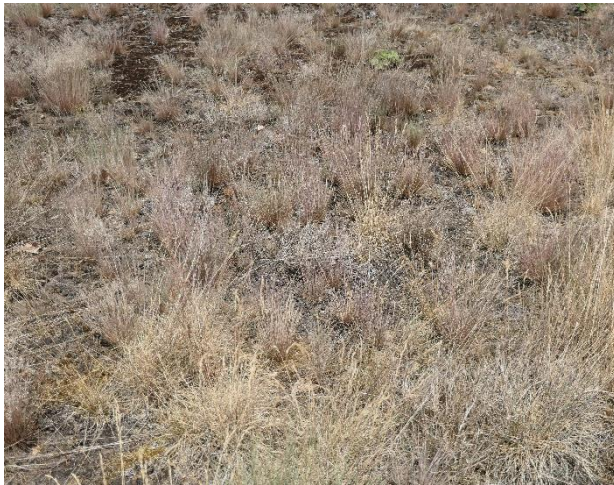
Abb. 4: Silbergras-Pionierrasen (Biotop Nr. 52)