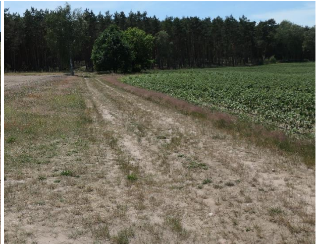
Abb. 21: unbefestigter Weg (Biotop Nr. 04, Blickrichtung Norden)