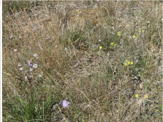
Abb. 3: Heidenelken-Grasnelkenflur (Biotop Nr. 51)