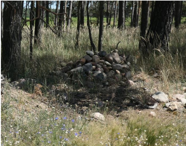
Abb. 18: Lesesteinhaufen, beschattet (Biotop Nr. 05, Blickrichtung Nordosten)