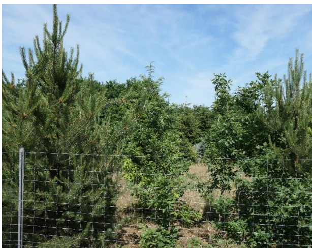
Abb. 15: Nadelholzforst mit Laubholzarten (Biotop Nr. 47, Blickrichtung Südwesten)