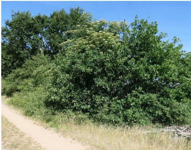
Abb. 7: Laubgebüsch (Biotop Nr. 06, Blickrichtung Nordwesten)