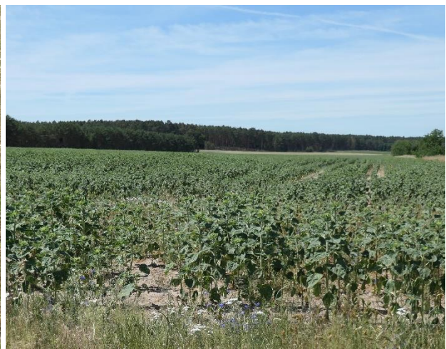
Abb. 17: Acker, Sonnenblume (Biotop Nr. 68, Blickrichtung Westen)