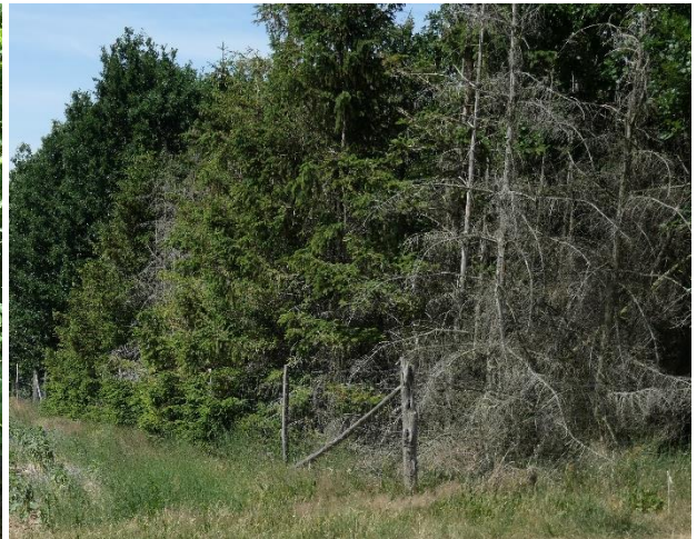
Abb. 14: Fichtenforst (Biotop Nr. 54, Blickrichtung Nordwesten)