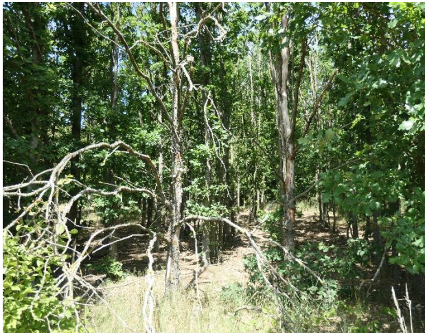
Abb. 13: Eichenforst (Biotop Nr. 53, Blickrichtung Norden)