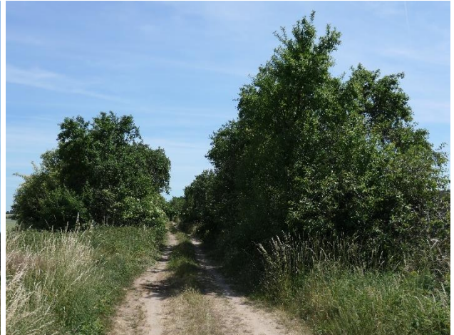
Abb. 6: Obstbaumallee, lückig (Biotop Nr. 67, Blickrichtung Osten)