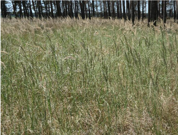
Abb. 1: Landreitgrasflur (Biotop Nr. 33, Blickrichtung Südwesten)