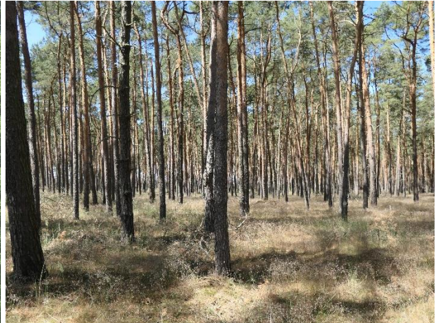
Abb. 12: Kiefernforst (Biotop Nr. 21, Blickrichtung Osten)