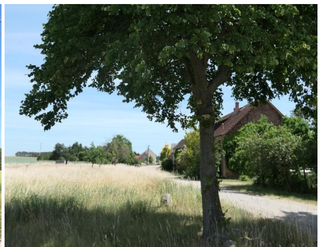
Abb. 10: Solitärbaum, Linde ( Tilia spec. ) (Biotop Nr. 62, Blickrichtung Osten)