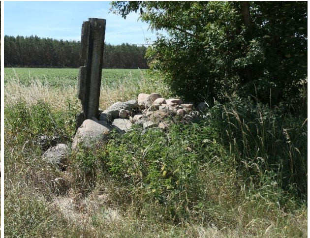
Abb. 19: Lesesteinhaufen, unbeschattet (Biotop Nr. 73, Blickrichtung Südosten)