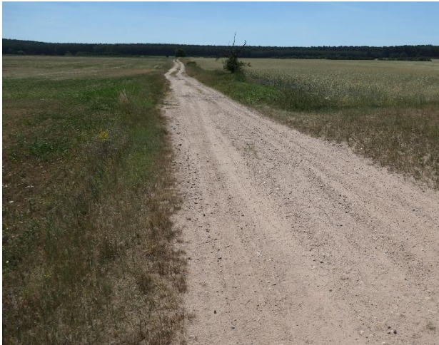
Abb. 20: Schotterweg (Biotop Nr. 05, Blickrichtung Nordosten)