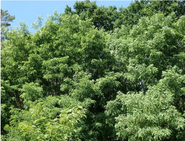
Abb. 11: Robinien-Eichen-Wald (Biotop Nr. 03, Blickrichtung Westen)