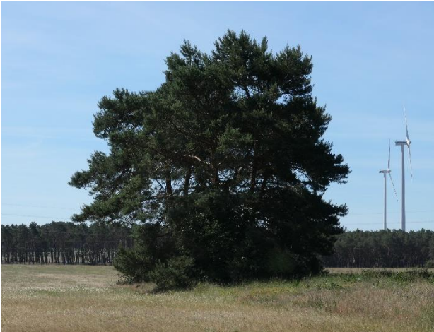
Abb. 5: Baumgruppe, Kiefer ( Pinus sylvestris ) (Biotop Nr. 10, Blickrichtung Süden)