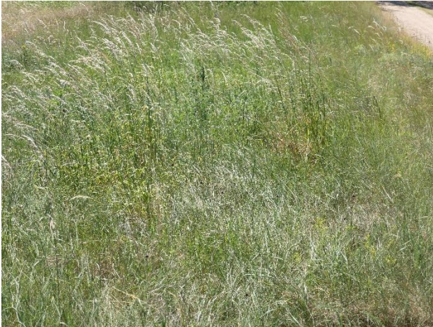
Abb. 2: ruderale Wiese am Wegrand (Biotop Nr. 15, Blickrichtung Süden)