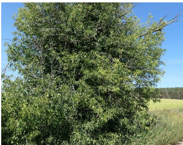
Abb. 9: Solitärbaum, Birne ( Pyrus communis ) (Biotop Nr. 18, Blickrichtung Nordwesten)